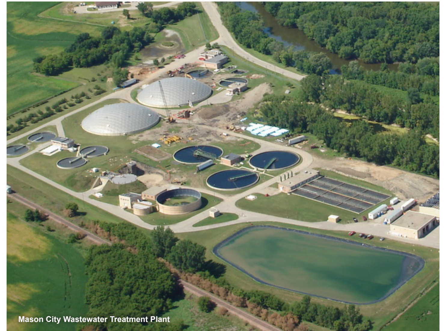
Mason City Wastewater Treatment Plant